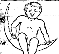
On the Ragged Edge

How does he feel?—He has irregular bowels and peculiar stools—August Flower the Remedy. @